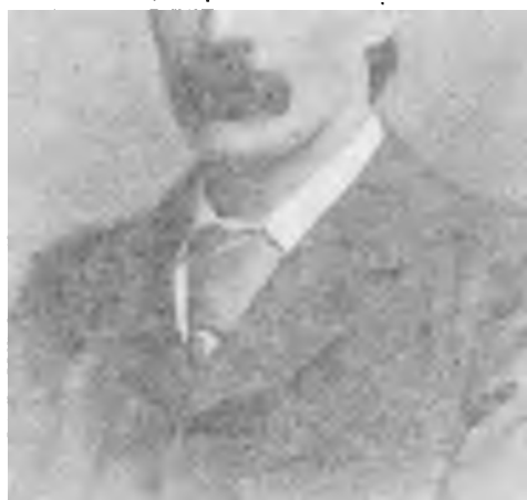
FRANKLIN D. ROOSEVELT